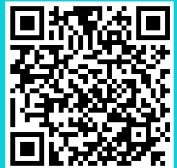
QR Code to First Survey

If you are interested in participating, please fill out the survey at the QR code above or at this link: